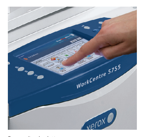
Personalized solutions you access right from the touch screen interface.

ScanFlowStore software by Nuance® greatly reduces document processing time with its powerful Optical Character Recognition technology. Using template-based scanning, a user simply selects specific "zones" on a document from which data specific to industries such as healthcare, legal or financial, is captured and used for file naming, creating network folders, populating PDF properties, searching and retrieving, and routing scanned documents to their correct repositories.